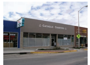
Catholic Charities – Farmington