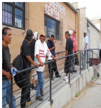
In Farmington our guests gather for an evening meal offered through our San Juan office.