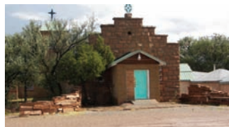
St. Anne Mission in Klagetoh, AZ