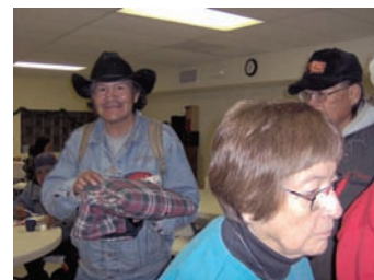
The day begins with a hearty breakfast served by volunteers at the Catholic Charities main office in Gallup.

On July 2-3 community volunteers from White Mountain performed On Golden Pond. Spearheaded by the Camelot Repertory Company, St. Mary's parish provided the venue. $7,625.00 was donated to Catholic Charities to provide food, rental, utility and transportation assistance to those in need.