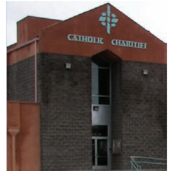
Catholic Charities Offices on Route 66 in Gallup, NM.